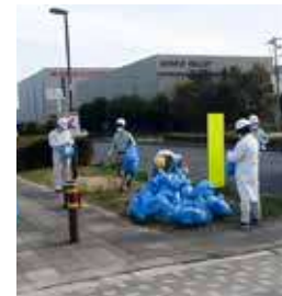
Road-cleaning activity along the Amahou Line (Amagasaki Plant, 3/27/2023)