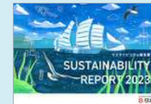
Sustainability Report 2023 Traditional Utasebune Boat in the Shiranui Sea