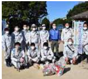
Sunagawa Park cleanup (Aichi Works, 10/22/2022)