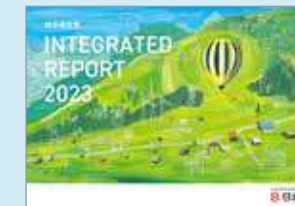
Integrated Report 2023 Alps Village and Hot Air Balloon