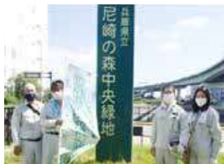
Amagasaki forest central green space forestation activities (Amagasaki Plant, 9/16/2022)

In addition to learning about the process of reforestation and the importance of biodiversity, they also experienced the satisfaction of nurturing rich natural forests. In recognition of these activities which have continued for many years, we received the SDGs Award from Hyogo Prefecture.