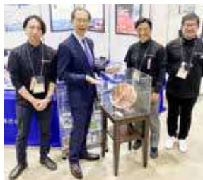
Exhibit at the Robot & Aerospace Festa Fukushima 2022 in Koriyama (Nippon Koki Co., Ltd.)