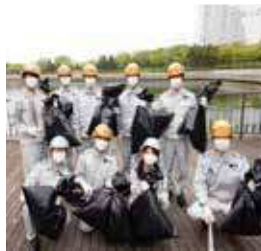
Nakabori canal walkway cleanup (Amagasaki Plant, 4/26/2022)

The NOF Group is actively engaged in volunteer activities to clean the areas surrounding its plants.