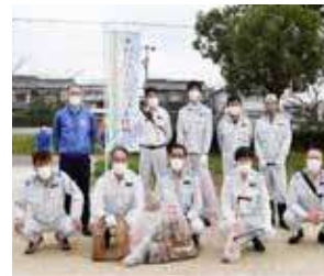
Fuki Port cleanup (Aichi Works, 6/25/2022)