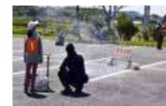
Model rocket launch contest (Aichi Works)