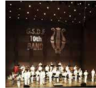
Community Concert in Taketoyo with the GSDF 10th Band (Aichi Works, 8/11/2022)

The Aichi Works invited 400 residents of Taketoyo Town to Taketoyo Town Yumetaro Plaza and sponsored a community concert by the GSDF 10th Band.