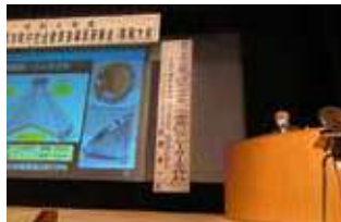
Lecture on HAYABUSA2 at the Fukushima Prefecture Social Education Instructor Workshop (Nippon Koki Co., Ltd.)