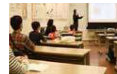
Model rocket-making class (Aichi Works)

The Taketoyo Plant sponsored the Sky Cup model rocket-making class and launch tournament that took place at the Yumetaro Plaza in April 2022. After NOF employees gave a lecture on how to make rockets, participants launched the rockets they made.