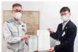
Received Hyogo Prefecture's SDGs Award (Amagasaki Plant, 2/20/2023)