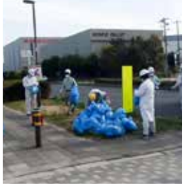
Road-cleaning activity along the Amahou Line (Amagasaki Plant, 3/27/2023)