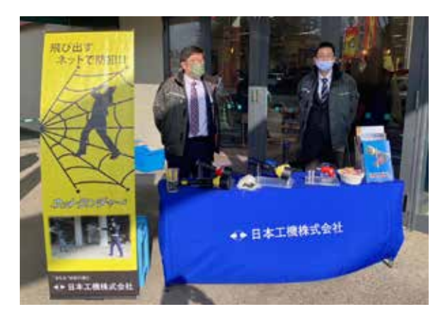
Exhibit of the NET LAUNCHER crime prevention device at the Shirakawa Police Station's "Dial 110 Day" (Nippon Koki Co., Ltd.)

Nippon Koki Co., Ltd. cooperated with the local Shirakawa Police Station's "Dial 110 Day" event by exhibiting its crime prevention products and demonstrating the NET LAUNCHER.