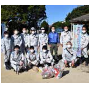
Sunagawa Park cleanup (Aichi Works, 10/22/2022)