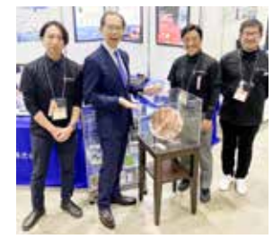
Exhibit at the Robot & Aerospace Festa Fukushima 2022 in Koriyama (Nippon Koki Co., Ltd.)