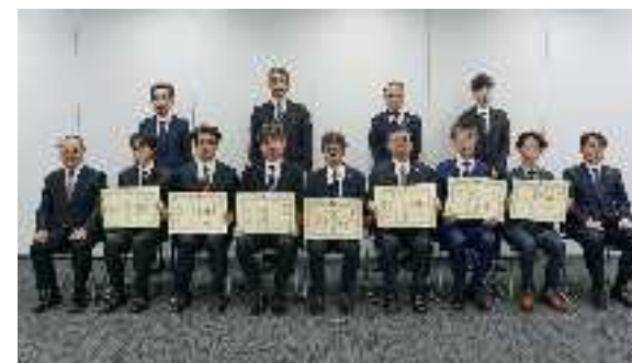
Ceremony for the employee invention reward

In April each year, NOF examines employee inventions and awards invention rewards to inventors.