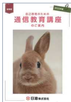
Pamphlet “Correspondence Course Guide”