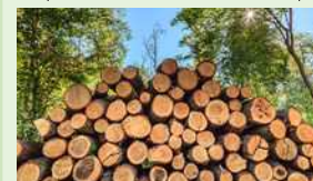
Use of FSC-certified paper