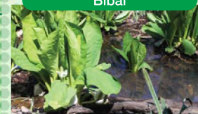
Protection of Japanese swamp lantern clusters (Nippon Koki Co., Ltd.)