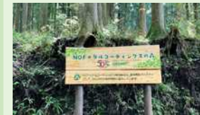
Participation in the Forest Restoration Partner System (NOF METAL COATINGS ASIA PACIFIC CO., LTD.)