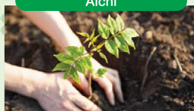
Taketoyo community tree planting festival (seedling purchase and sponsorship)