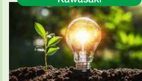
Purchase of electricity certified to come from non-fossil fuel sources