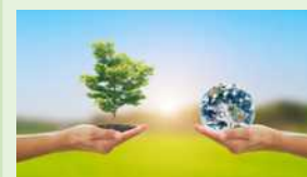
RSPO membership, participation in the Japan Business and Biodiversity Partnership, endorsement of the Keidanren Initiative for Biodiversity Conservation, participation in JaSPON