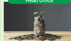
Donations aimed at protecting the global environment (WWF, Green Fund, Keidanren Nature Conservation Fund, etc.)