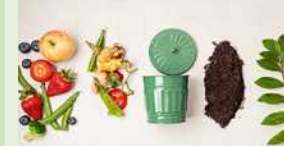
Food waste reduction (functional foods)