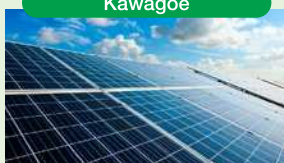
Solar panels (NIGK Corporation)