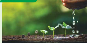
Participation in “Amagasaki Forest Central Green Space Forest Planting” volunteer activities