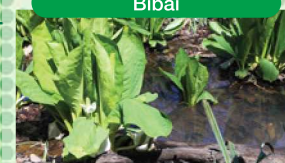
Protection of Japanese swamp lantern clusters (Nippon Koki Co., Ltd.)