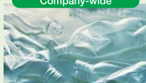
Recycling of plastic waste