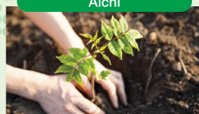
Taketoyo community tree planting festival (seedling purchase and sponsorship)