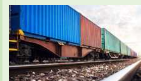
Modal shifting, joint deliveries