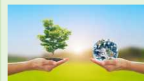
RSPO membership, participation in the Japan Business and Biodiversity Partnership, endorsement of the Keidanren Initiative for Biodiversity Conservation, participation in JaSPON