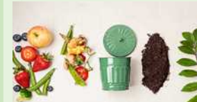
Food waste reduction (functional foods)