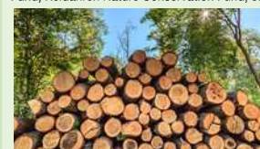
Use of FSC-certified paper