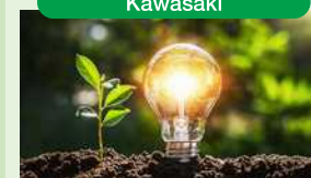
Purchase of electricity certified to come from non-fossil fuel sources