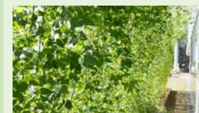
Participation in the Kawasaki City Green Office Promotion Council Creation of rooftop greenery, green walls, and greenery on our grounds