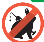
Introduction of alternative methods to animal testing in the evaluation of cosmetics materials (animal welfare)