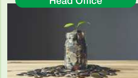
Donations aimed at protecting the global environment (WWF, Green Fund, Keidanren Nature Conservation Fund, etc.)