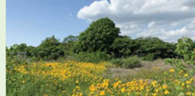
Weeding of the Designated Invasive Alien Species “lanceleaf tickseed”