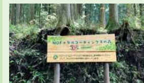
Participation in the Forest Restoration Partner System (NOF METAL COATINGS ASIA PACIFIC CO., LTD.)