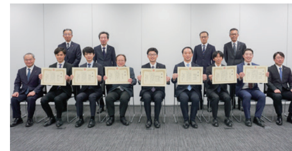
Employee invention reward ceremony

In April each year, NOF carries out an examination of employee inventions and awards invention rewards to inventors.