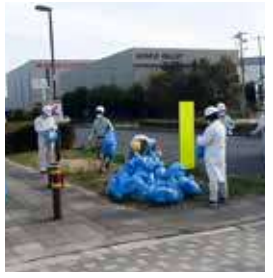
Road-cleaning activity along the Amahou Line (Amagasaki Plant, 3/27/2023)