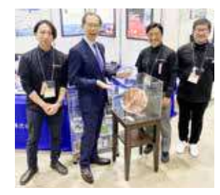
Exhibit at the Robot & Aerospace Festa Fukushima 2022 in Koriyama (Nippon Koki Co., Ltd.)