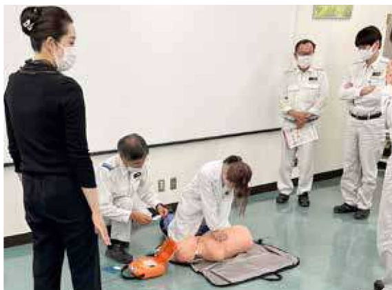
Lifesaving first aid training (Advanced Technology Research Laboratory)

To enable all the employees of the NOF Group to deepen their understanding of RC, emphatic efforts are put into RC education. In fiscal 2022, a total of 53,066 people participated in and received RC-related education and training for a total of some 41,000 hours.