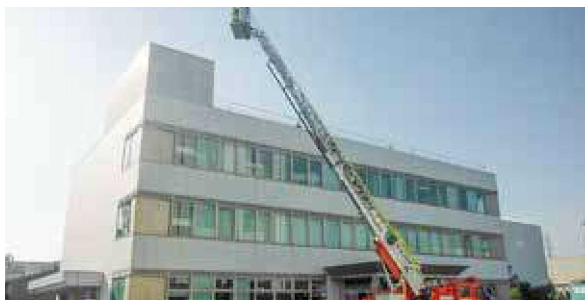
High-elevation rescue drill (Amagasaki Plant)