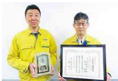
Japan Explosives Society Technology Award (Nippon Koki Co., Ltd.)