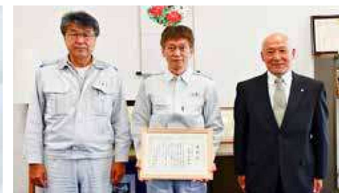
Award from the Bibai City Association for Safety Management of Hazardous Materials (HOKKAIDO NOF CORPORATION)