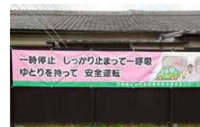
Traffic banner (Aichi Works)