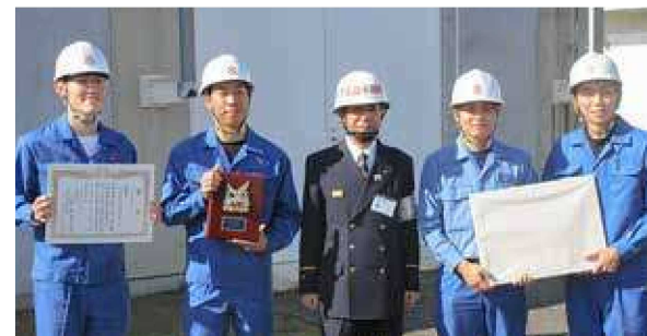
Annual Self-Defense Firefighting Maneuvers Competition (NiGK Corporation)