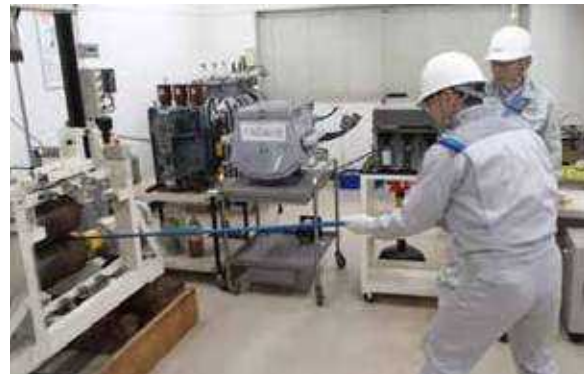
Experience of becoming entangled in rotating equipment (Amagasaki Plant)

We offered educational programs mainly for external entities so far, and we are currently working on more field-oriented education for our employees through the introduction of education by experience.