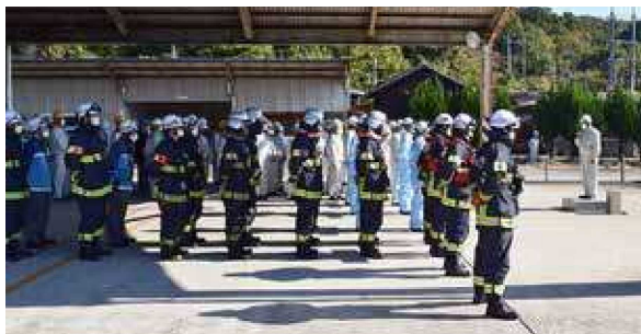
Joint disaster prevention drill with Taketoyo Town and neighboring fire departments (Aichi Works)

We also actively participate in local firefighting technique competitions to improve firefighting skills and appeal to communities by demonstrating our high level of safety awareness.