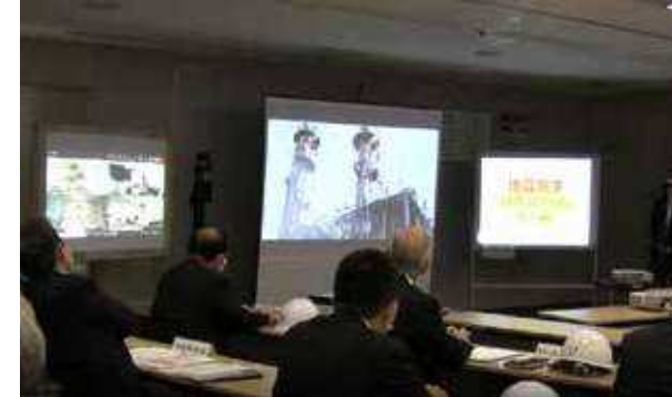
Company-wide joint drill (Emergency Headquarters at the Head Office)