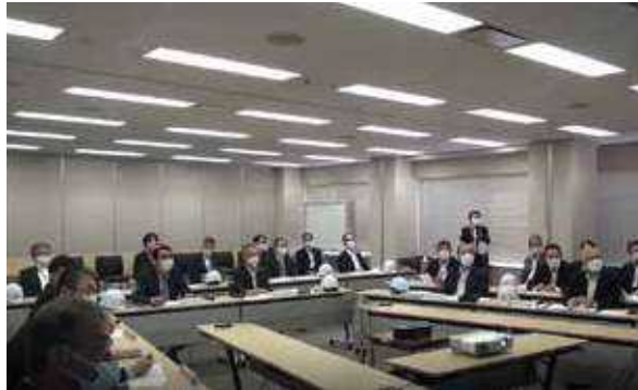
Company-wide joint drill (Head Office)

We are also actively expanding our BCP through ongoing efforts regarding the development of the BCP and education in preparation for emergencies such as infectious disease outbreaks and cyberattacks.