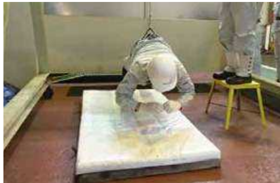
Experience of high-elevation falls (Amagasaki Plant)