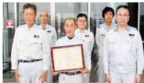
Kanagawa Prefecture Industrial Safety Award (Kawasaki Works)