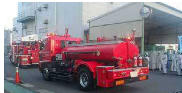
Joint comprehensive disaster prevention drill with the Chidori District Disaster Prevention Association (Kawasaki Works)