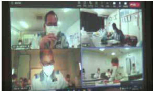
Company-wide joint drill (online: Kawasaki Works, Aichi Works, Amagasaki Plant, Oita Plant)