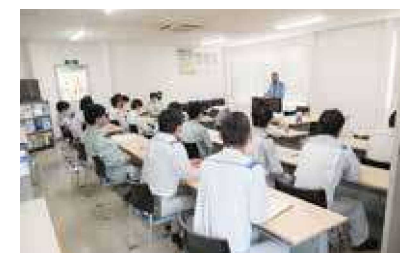
Traffic safety education by the Oita East Police Station (Oita Plant)

In order to reduce the number of accidents during commutes and work-related traffic accidents, which occurred frequently during fiscal 2022, we enhanced our traffic safety measures. Each works, plant, and affiliate implements its own traffic safety activities according to its own circumstances. The activities implemented included distribution of pamphlets during a traffic safety week, a safety lecture by the police, and raising a road safety slogan banner.