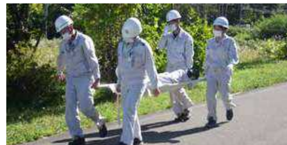
Injured person transportation drill (HOKKAIDO NOF CORPORATION)