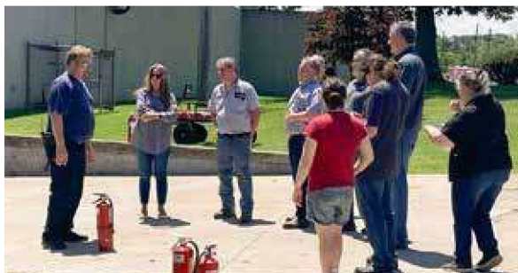
Fire extinguisher training (MCNA)