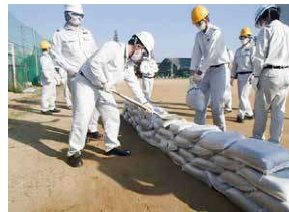
Spill prevention drill (Amagasaki Plant)