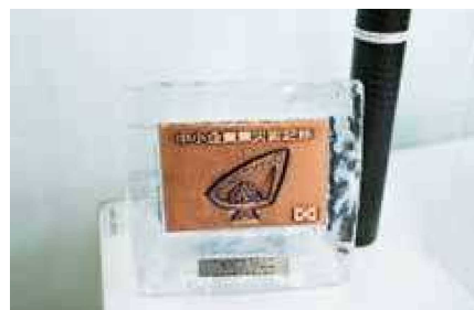
Prize in the Zero-Accident Certification Program for SMEs (NICHIYU LOGISTICS CO., LTD. (Oita))