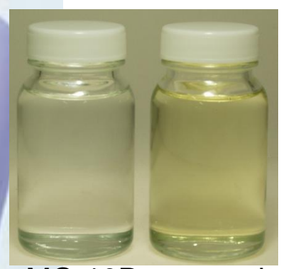
MG-10P competitor product