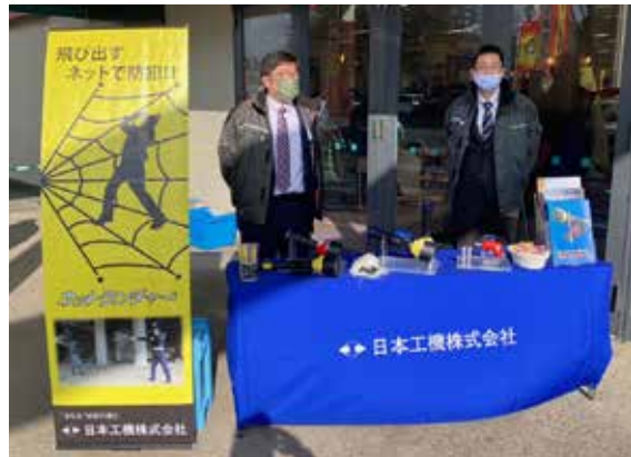
Exhibit of the NET LAUNCHER crime prevention device at the Shirakawa Police Station's "Dial 110 Day" (Nippon Koki Co., Ltd.)

Nippon Koki Co., Ltd. cooperated with the local Shirakawa Police Station's "Dial 110 Day" event by exhibiting its crime prevention products and demonstrating the NET LAUNCHER.