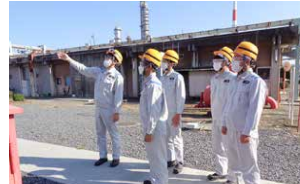
Acceptance of internships for students from Prefectural Oita Technical High School (Oita Plant)