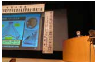
Lecture on HAYABUSA2 at the Fukushima Prefecture Social Education Instructor Workshop (Nippon Koki Co., Ltd.)