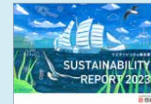
Sustainability Report 2023 Traditional Utasebune Boat in the Shiranui Sea