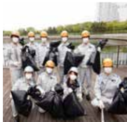
Nakabori canal walkway cleanup (Amagasaki Plant, 4/26/2022)

The NOF Group is actively engaged in volunteer activities to clean the areas surrounding its plants.