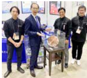
Exhibit at the Robot & Aerospace Festa Fukushima 2022 in Koriyama (Nippon Koki Co., Ltd.)