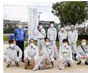
Fuki Port cleanup (Aichi Works, 6/25/2022)