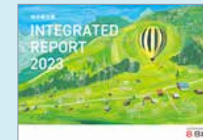
Integrated Report 2023 Alps Village and Hot Air Balloon