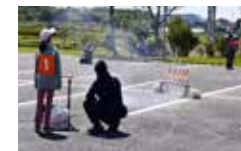
Model rocket launch contest (Aichi Works)