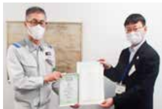
Received Hyogo Prefecture's SDGs Award (Amagasaki Plant, 2/20/2023)