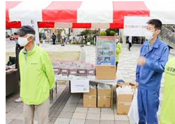
Exhibit at the welfare market of the event commemorating the 100th anniversary of Kawagoe City's establishment (NiGK Corporation)

In Kawagoe City, where NiGK Corporation is located, a local conference event was held to commemorate the 100th anniversary of the city's establishment and to provide an opportunity to discuss how to create a better community. We provided humus from our plant to the "welfare market" at the event.