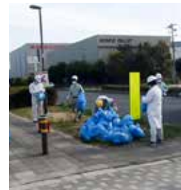
Road-cleaning activity along the Amahou Line (Amagasaki Plant, 3/27/2023)