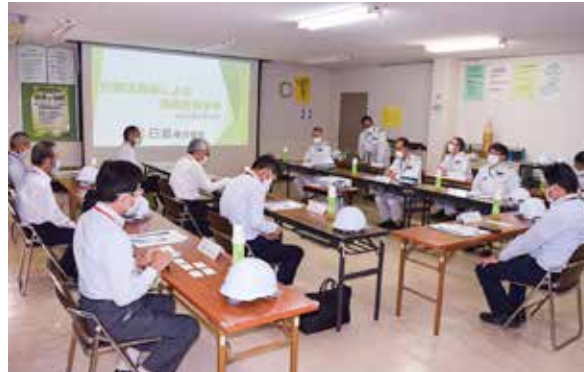
Works tour for neighboring ward leaders (Aichi Works)

In fiscal 2022, there were cancellations due to COVID-19 one after the other of dialogues with communities and factory tours that we used to hold every year on a regular basis. Once the situation improves, we plan to resume interaction and communication with members of local communities.