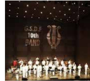
Community Concert in Taketoyo with the GSDF 10th Band (Aichi Works, 8/11/2022)

The Aichi Works invited 400 residents of Taketoyo Town to Taketoyo Town Yumetaro Plaza and sponsored a community concert by the GSDF 10th Band.