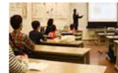
Model rocket-making class (Aichi Works)

The Taketoyo Plant sponsored the Sky Cup model rocket-making class and launch tournament that took place at the Yumetaro Plaza in April 2022. After NOF employees gave a lecture on how to make rockets, participants launched the rockets they made.