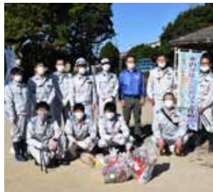
Sunagawa Park cleanup (Aichi Works, 10/22/2022)