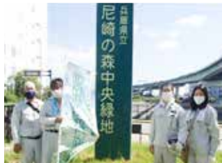
Amagasaki forest central green space forestation activities (Amagasaki Plant, 9/16/2022)

In addition to learning about the process of reforestation and the importance of biodiversity, they also experienced the satisfaction of nurturing rich natural forests. In recognition of these activities which have continued for many years, we received the SDGs Award from Hyogo Prefecture.